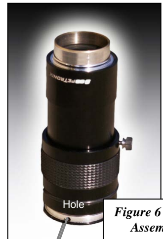
Figure 6 - Lens Assembly