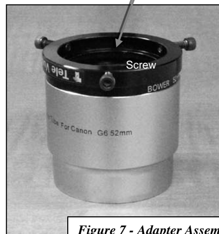
Figure 7 - Adapter Assembly