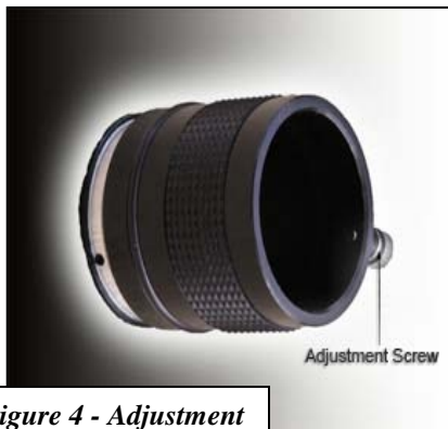
Figure 4 - Adjustment Cylinder