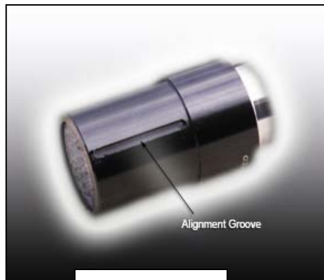
Figure 5 - Lens