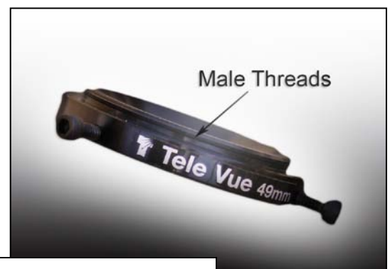
Figure 3 - Adapter Ring