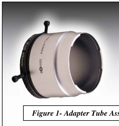
Figure 1 - Adapter Tube Assembly