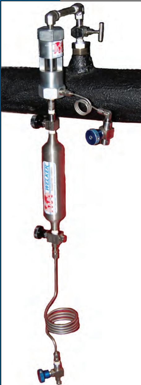
Complete Spot Sampling System with Fluid Sentinel