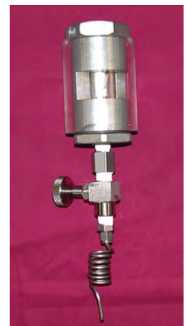
Fluid Sentinel unit complete with valve and pigtail

13839 West Belfort • Sugar Land, TX 77498-1671 Telephone: (281) 491-2331 • Toll Free: (800) 776-7267 • Fax: (281) 491-8344 Sales Email: Sales@welkereng.com • Web Site: www.welkereng.com