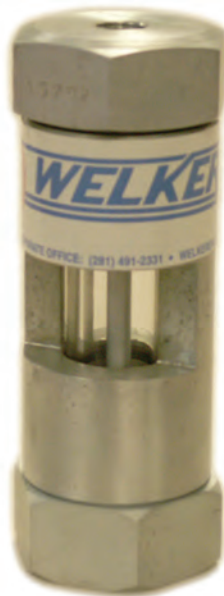
Fluid Sentinel unit

Welker® ... Global Solutions for Your Needs!