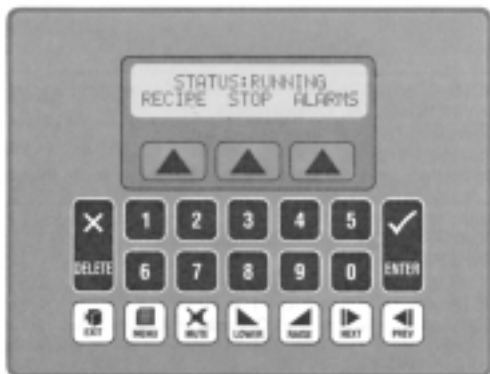
PLC Automation or Manual Version

Stainless Steel, Carbon Steel and Other Materials Available